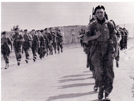
Newly formed 1st Battalion DERR deployed in Libya on Exercise Starlight . Those with sharp eyes will note that the cap badge within the Brandywine is a Wyvern

Trying to load vehicles onto a Hastings Aircraft with only a side door proved to be a challenge, having to reverse up an angled ramp with a trailer, we managed to ground a few aircraft, but all flew again after repair. This was a build up for Exercise Starlight 1, to be held in Libya.