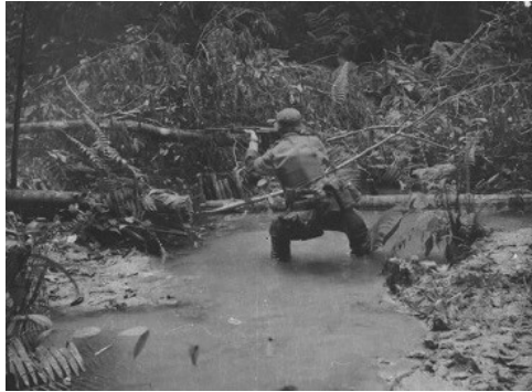
A member of A Company on a Close Quarter Battle (CQB) Range during Exercise Sanjak.

From the flesh pots of West Germany to the North Yorkshire Moors seemed like a backward step, but little did we know just how diverse and interesting the tour was to become. A Company carried out Exercise Sanjak in Malaya based on the Jungle Warfare School in Johore – Bahru. Who was the Cpl that dropped his AR 15 in the river resulting in the Royal Navy divers from Singapore having to recover the missing weapon in the dark. I think he may have been in the Signal Pl.