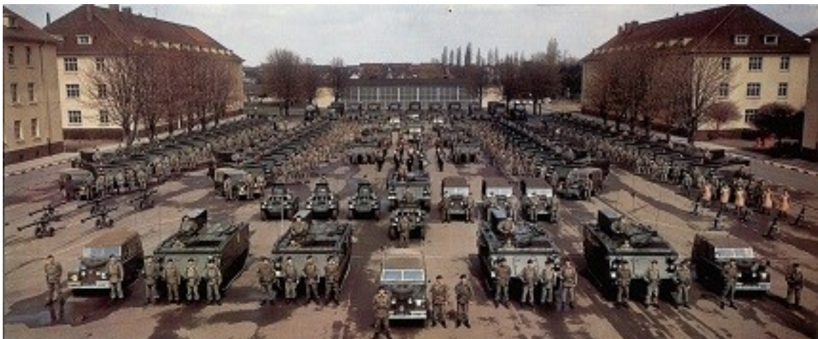
The iconic photograph of a Mechanised Infantry Battalion taken from the attic window of the Warrant Officers and Sergeants mess in Clifton Barracks in 1969. This image formed the centre piece of the Battalion souvenir of that very successful tour.

Re-joined the Battalion in Minden West Germany who were now Mechanized and part of 11 Infantry Brigade, again in A Company as Platoon Sgt. We became a first class battalion in the Mech Role and were respected throughout BAOR. We set the standard for others to follow, I must have done something right as I was promoted to CQMS of A Company, a very enjoyable post. It's not everyone who can race around the country side in a Stalwart. Crossing the River Weser at night was a challenge but we always made it to the far bank unlike some others, who I won't mention, (B Coy). Our time in Minden was over far too soon. The Battalion had fired on all six or eight cylinders and proved itself once again.