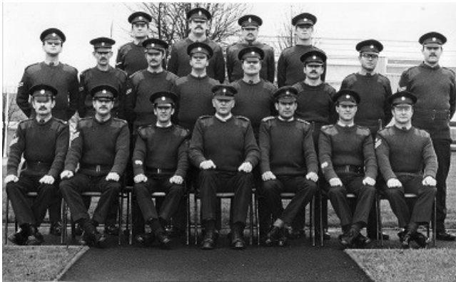
Quartermaster's Department Aldergrove

Back to Canterbury and prepare for the move to Aldergrove Northern for yet another two-year tour. As part of 8 Bde the Battalion worked very hard with long hours spent in poor condition in various location throughout the province. As always, we came smiling through, looking forward to the upcoming tour in Hong Kong.