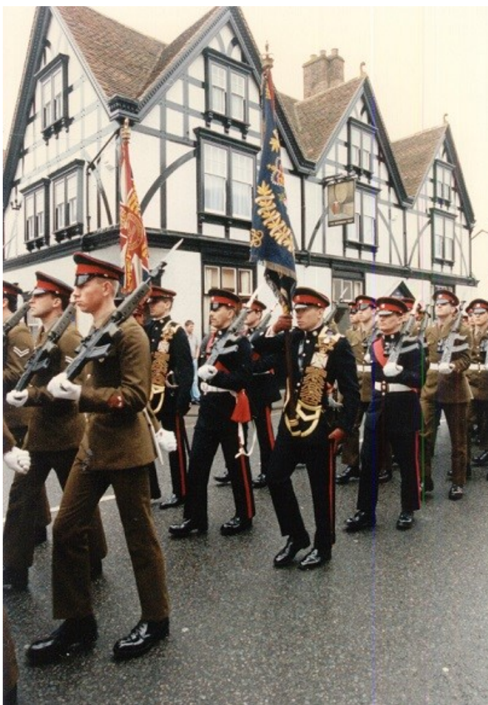
Colours on parade for the last time in the Freedom Town of Abingdon