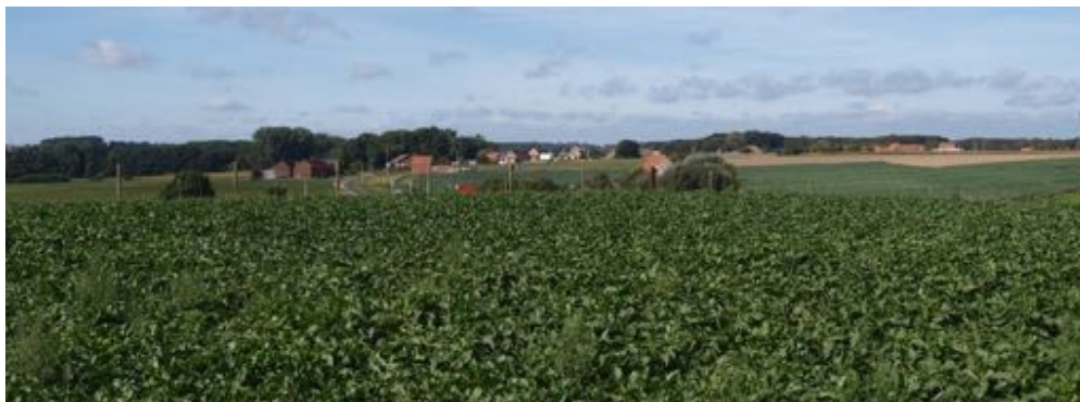
The view from the German positions towards the area held by 2 Wilts Regt in the Reutel action on the forward edge of Polygon Wood. The battalions came out of this action about a company strength.