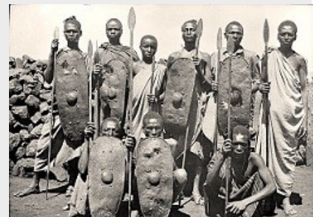
Ruga Ruga Tribesmen used by the Germans against 1st/4th KAR

For conspicuous gallantry and devotion to duty. Owing to his courageous example he rendered invaluable assistance in beating off a charge made by greatly superior forces of the enemy, upon whom heavy casualties were inflicted. Having withdrawn his men in good order, he finally carried a wounded officer back to safety under very heavy fire. His cool bearing and utter fearlessness were most praiseworthy