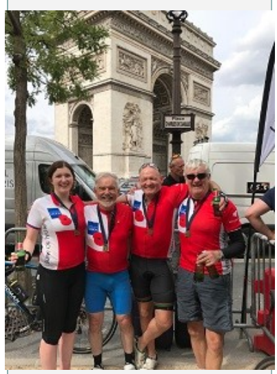
Successful Farmer's Boys Team at the Finish

The money raised will go towards the Legion's vital welfare work which covers a range of services such as comforting the bereaved, supporting the injured, grants for home adaptations to help veterans live independently in their own house, benefits and money advice, employment and retraining support, hospital visits and the provision of full nursing care.